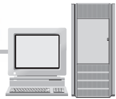
MS SQL server