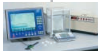
Testplace module with weighing station, tablet tester and dimension measurement