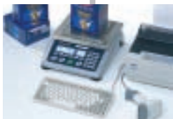
Remote weighing station